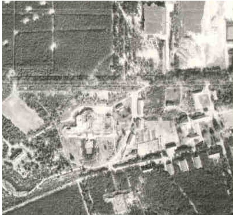
3 JD GefStd and Div.Dorf area on 19 SEP 1944, very little bombing is visible.