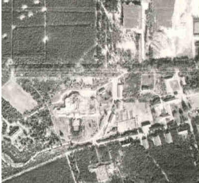
3 JD GefStd and Div.Dorf area on 19 SEP 1944, very little bombing is visible.