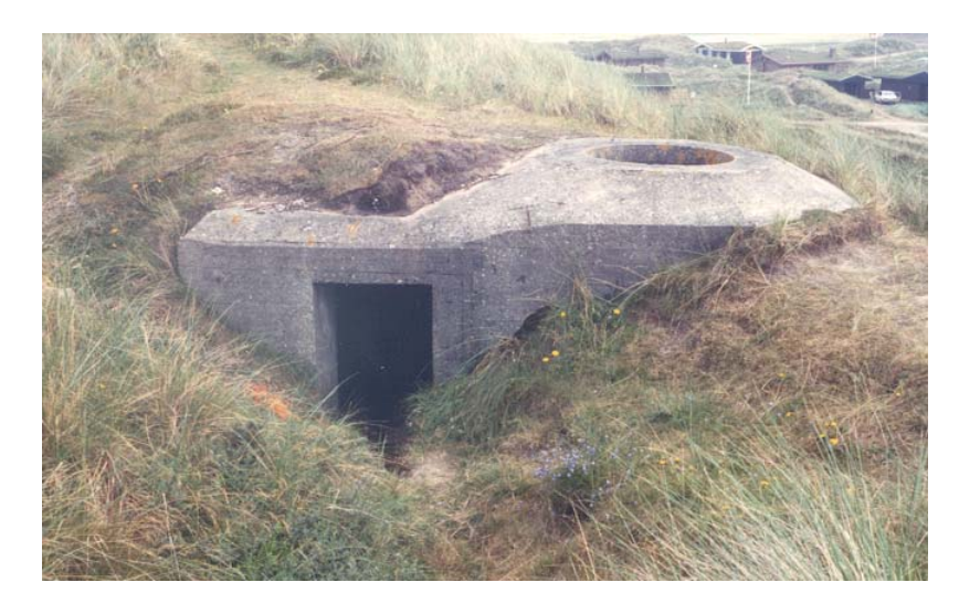
Type 58 c in RINGELNATTER.

This construction exists in a multitude of versions. With 40 cm and 60 cm thick walls and with a small and a large annex room. Some constructions have a short tunnel leading up to the entrance to prevent it from being obstructed by sliding sand. Additionally all versions can be found mirror imaged.